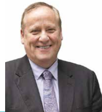
HON RITA SAFFIOTI MLA Deputy Premier; Minister for Tourism

A handwritten signature in black ink, appearing to read 'Don Punch'.