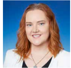
HON JESSICA STOJKOVSKI MLA Minister for Peel