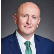
HON STEPHEN DAWSON MLC Minister for Regional Development