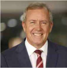
HON REECE WHITBY MLA Minister for Tourism

We hope everyone enjoys this event and takes the time to explore the dreamlike Peel region.